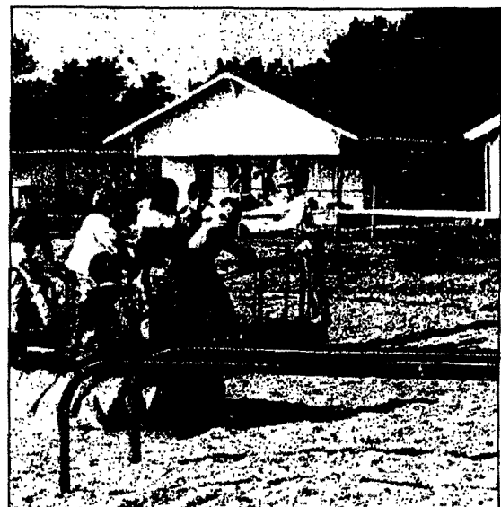
SOIL CONTAMINATION — Children at Washington Elementary Center enjoy a sunny morning, while nearby officials with the City of Blackwell cordon off an area that has been determined to be contaminated by lead.